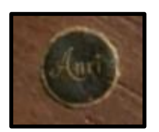
– Logo Change