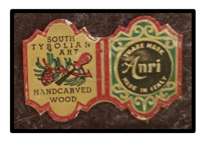
1954 to 1967 Logo