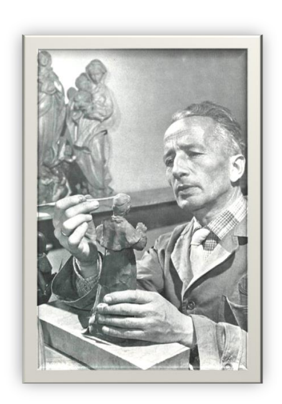
1959 - ANRI Form introduced. (ANRI Teak in 1962).